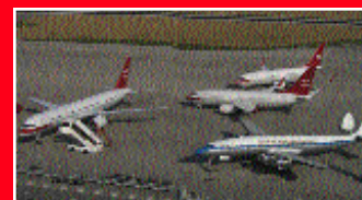
Two of PrivatAir's BBJs pictured alongside the Boeing 757 and the Breitling Super Constellation which is also flown by some of PrivatAir's pilots

For more information, visit Moscow-faf.com .