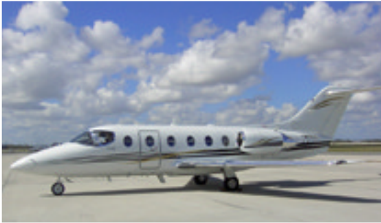
PrivatAir sells, manages and charts aircraft ranging from the Beechjet 400A (above) to luxurious Boeing Business Jets (right)